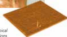
CristalGuard exposed to typical shower conditions